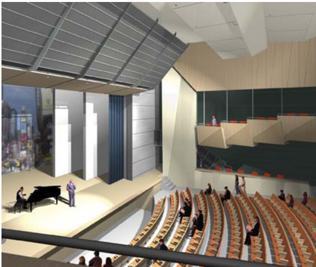
Pictured Below: Design image of the new school's Tony Bennett Concert Hall